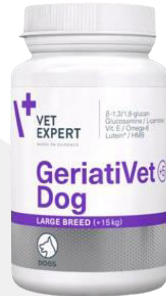
GeriatVet Large Breed